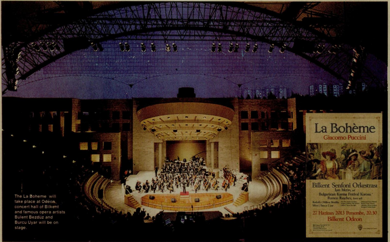
The La Bohème will take place at Odeon, concert hall of Bilkent and famous opera artists Bülent Bezdüz and Burcu Uyar will be on stage.